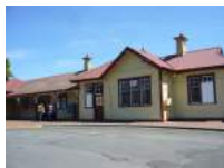
Trafalgar Art Spaces 1&2